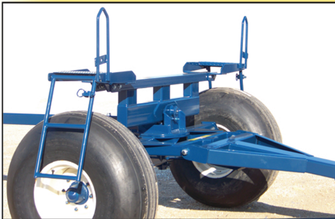
Optional Flip Ladder